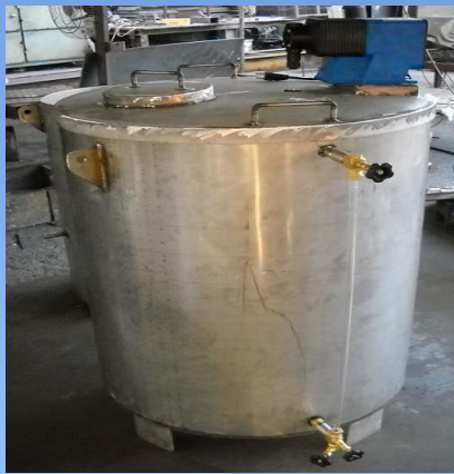
SS CHEMICAL TANK