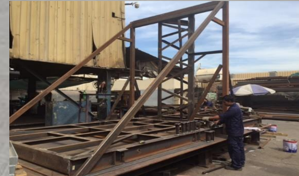
TELECOM TOWER SKID