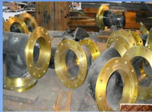
PIPE TO FLANGE WELDING