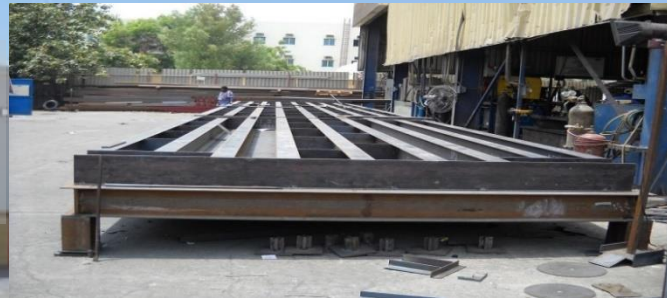
WEIGH BRIDGE, 3MTR X22 MTR